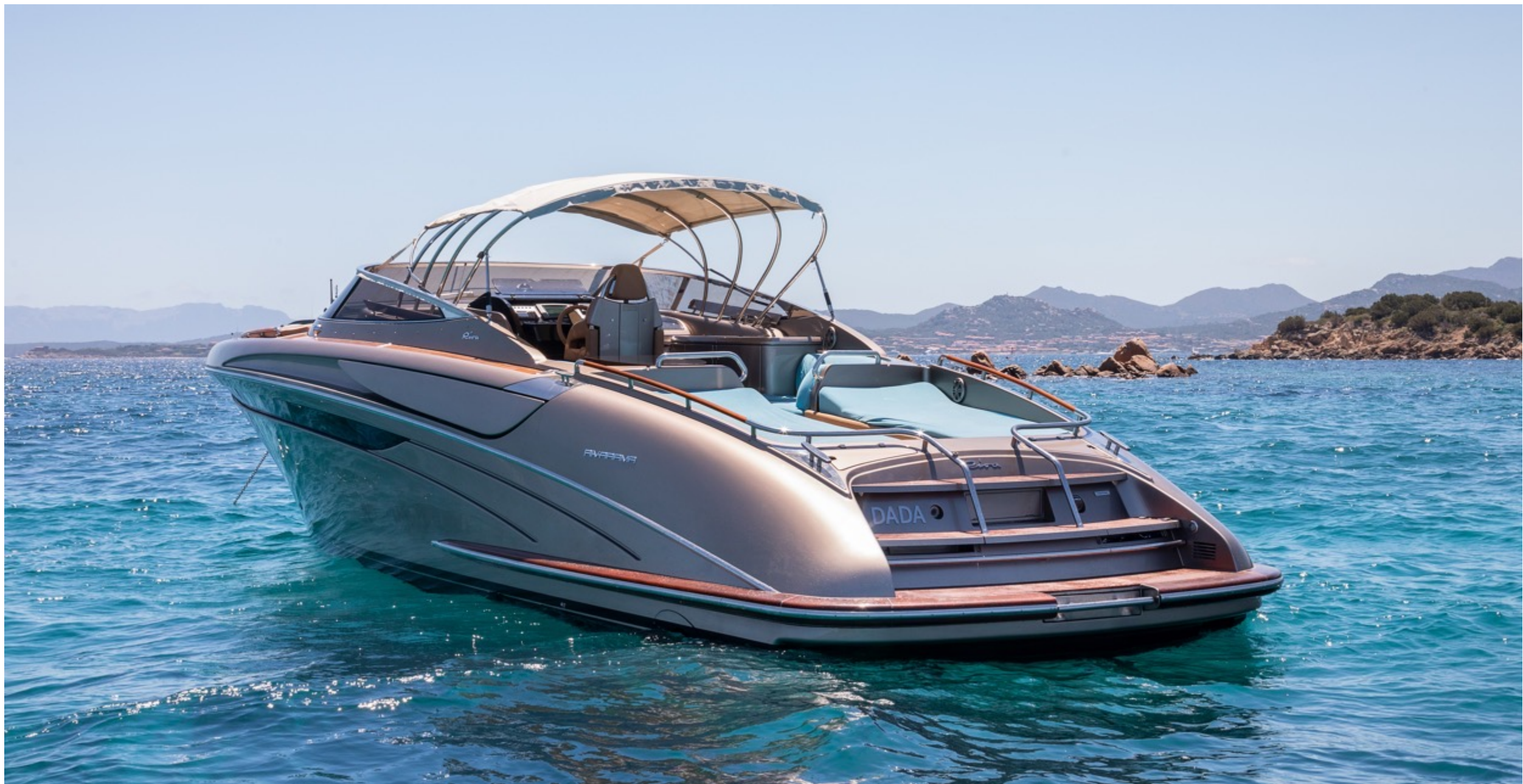
M/Y DADA | RIVARAMA 44