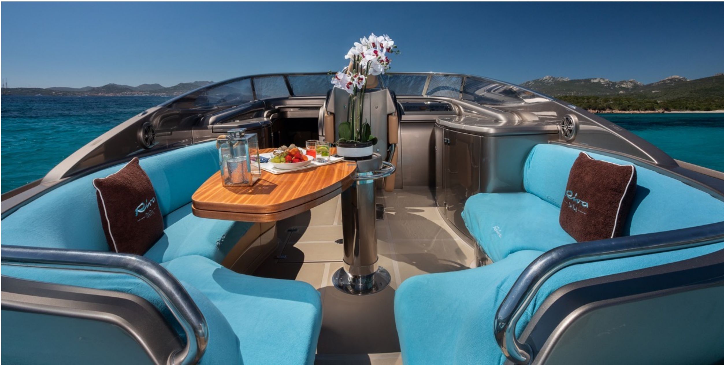
M/Y DADA | RIVARAMA 44