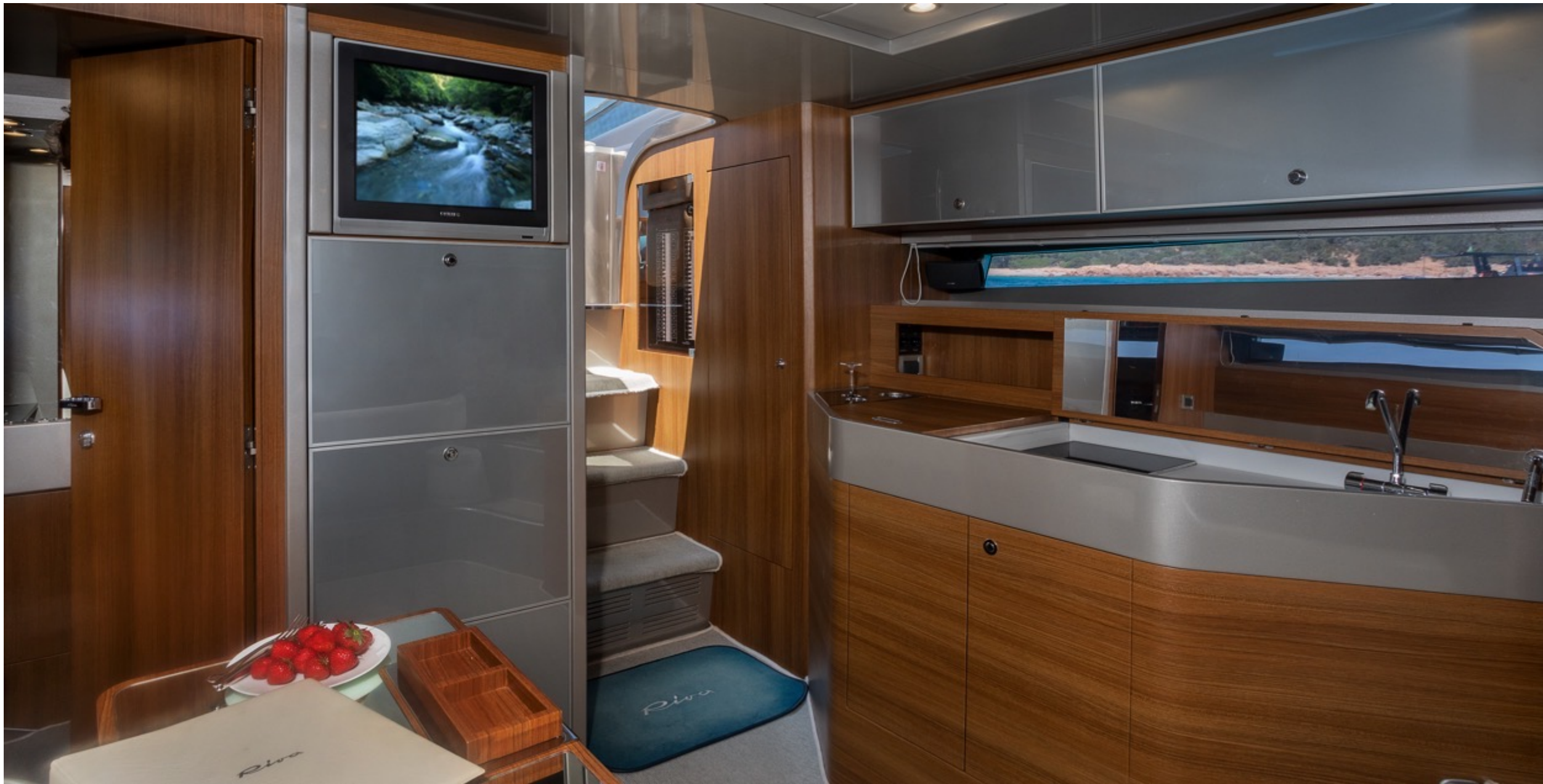
M/Y DADA | RIVARAMA 44