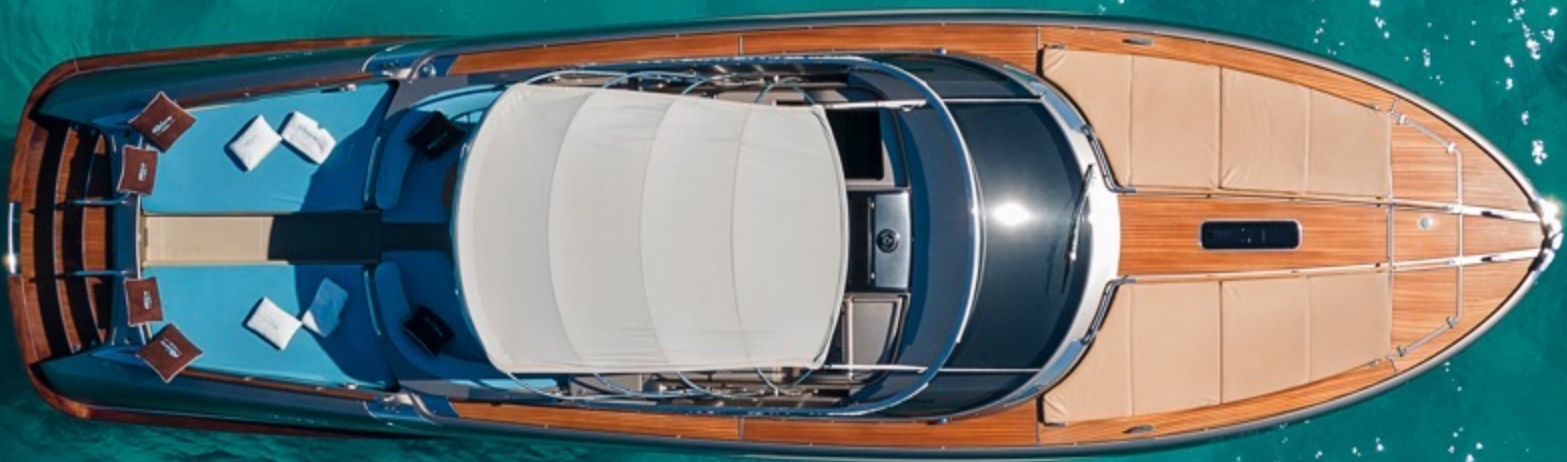
M/Y DADA | RIVARAMA 44