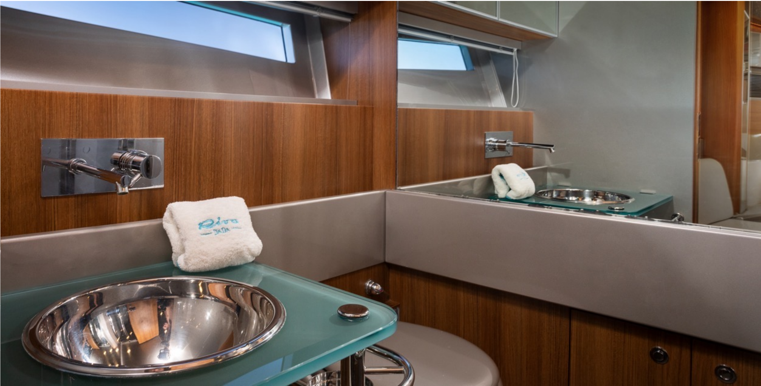
M/Y DADA | RIVARAMA 44