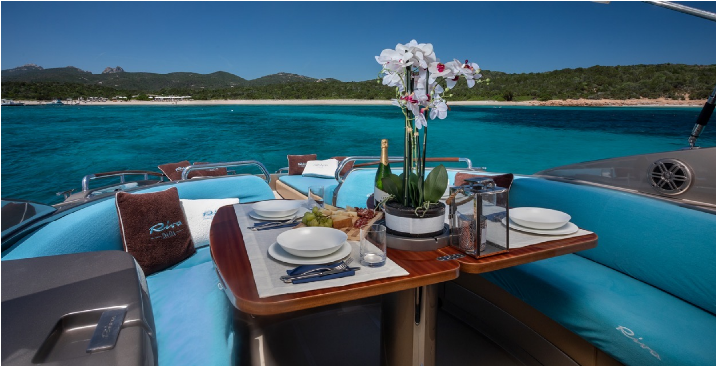
M/Y DADA | RIVARAMA 44