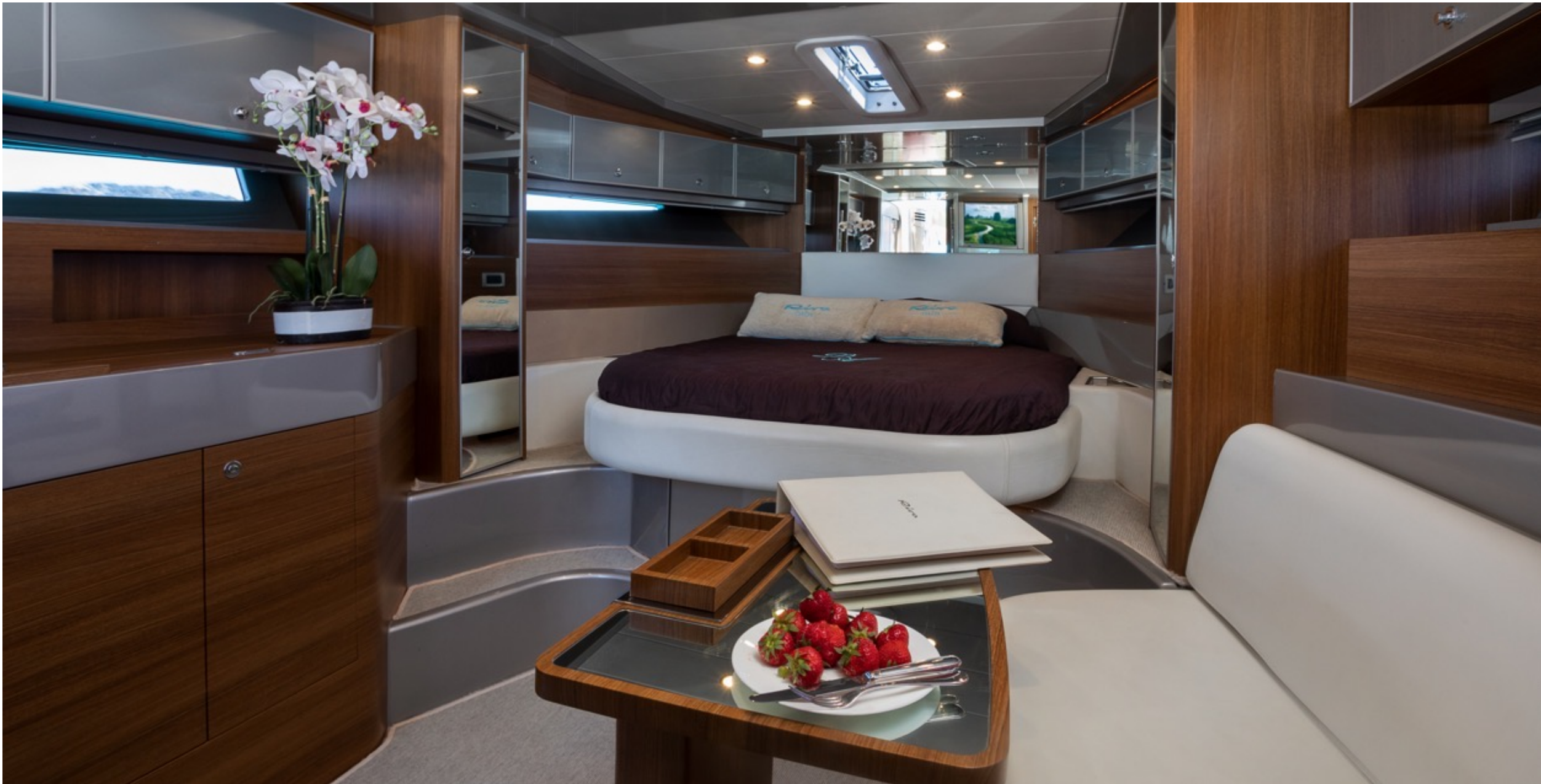
M/Y DADA | RIVARAMA 44