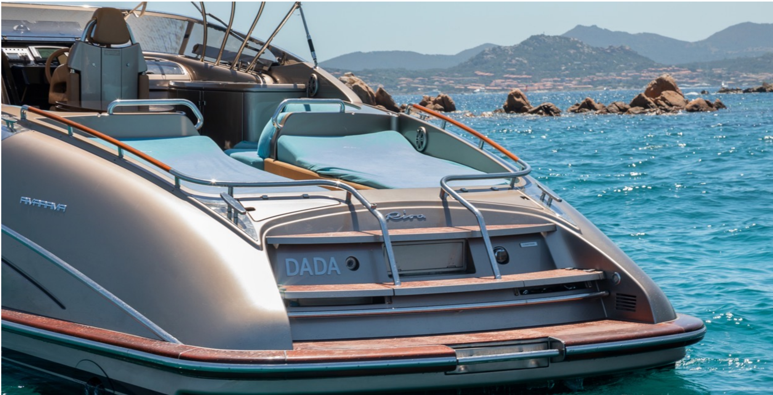
M/Y DADA | RIVARAMA 44