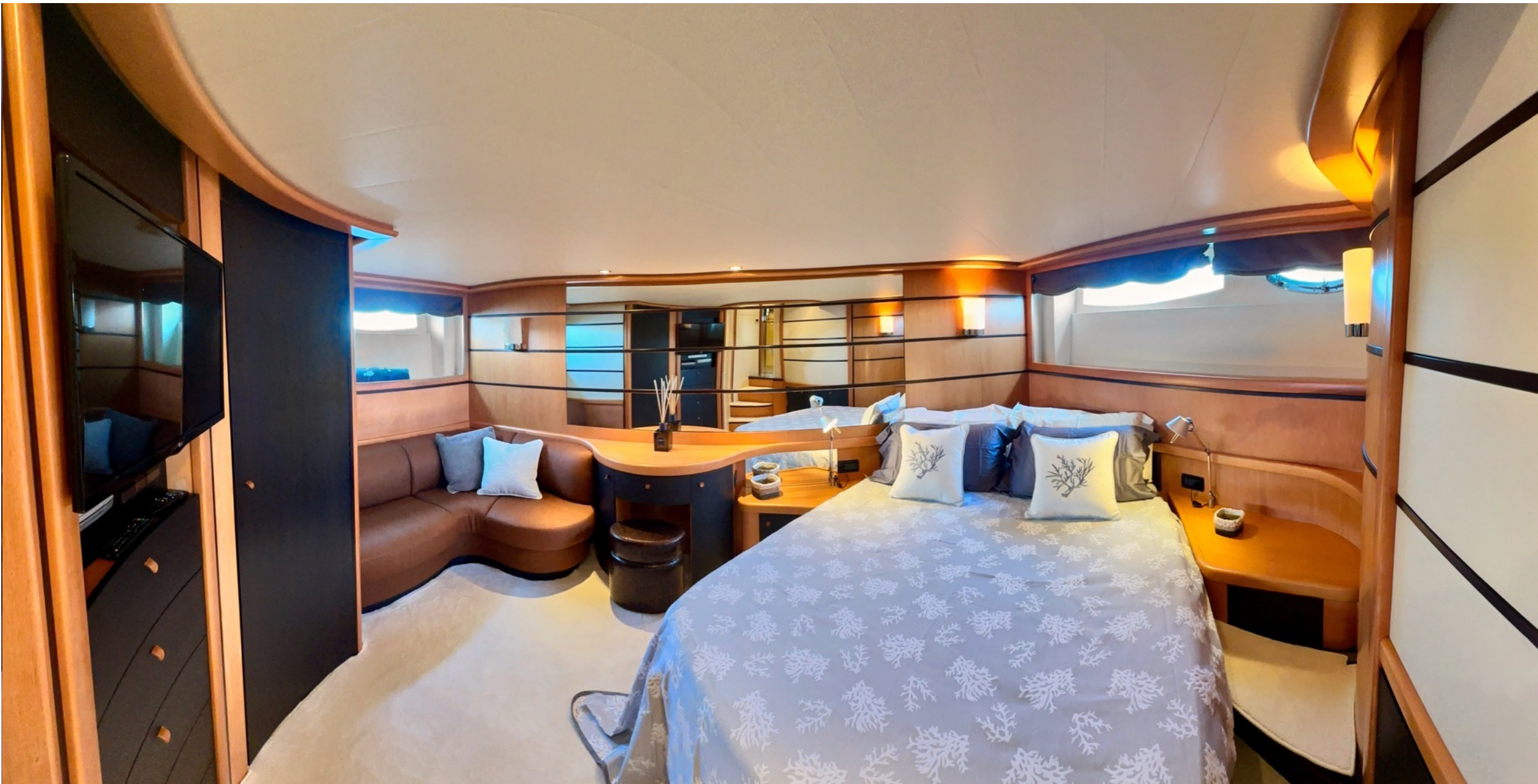
STINGER | PERSHING 76