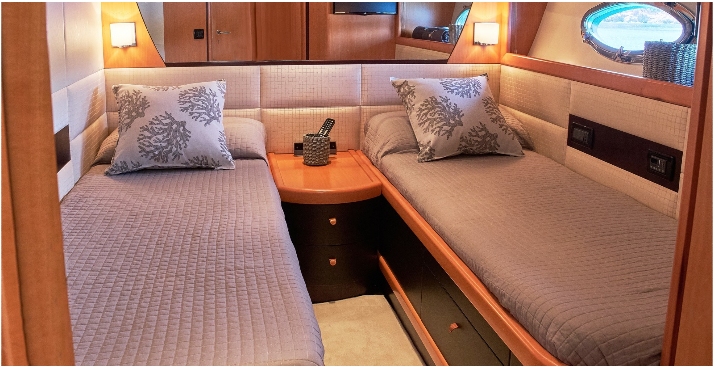
STINGER | PERSHING 76