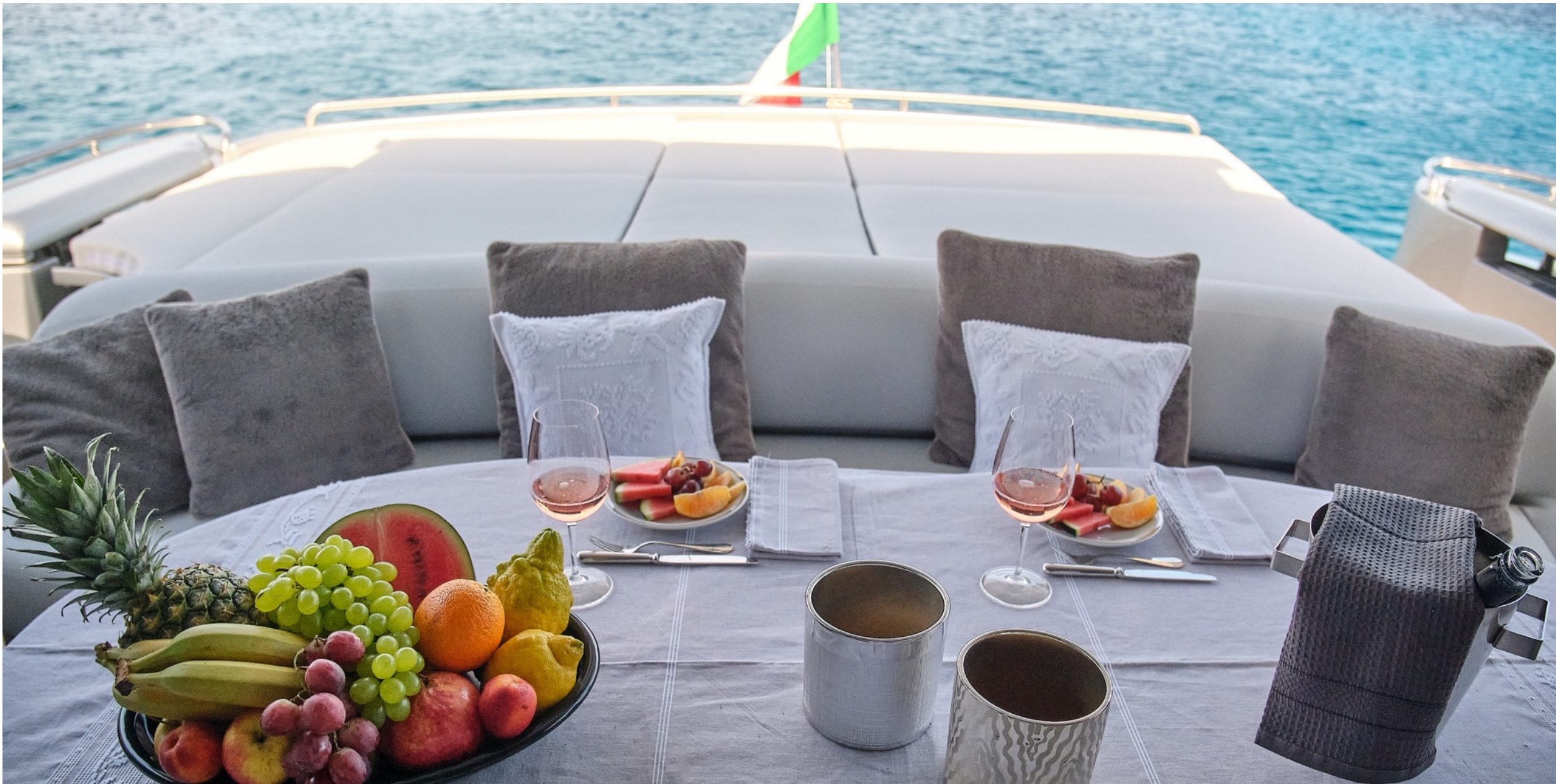
STINGER | PERSHING 76