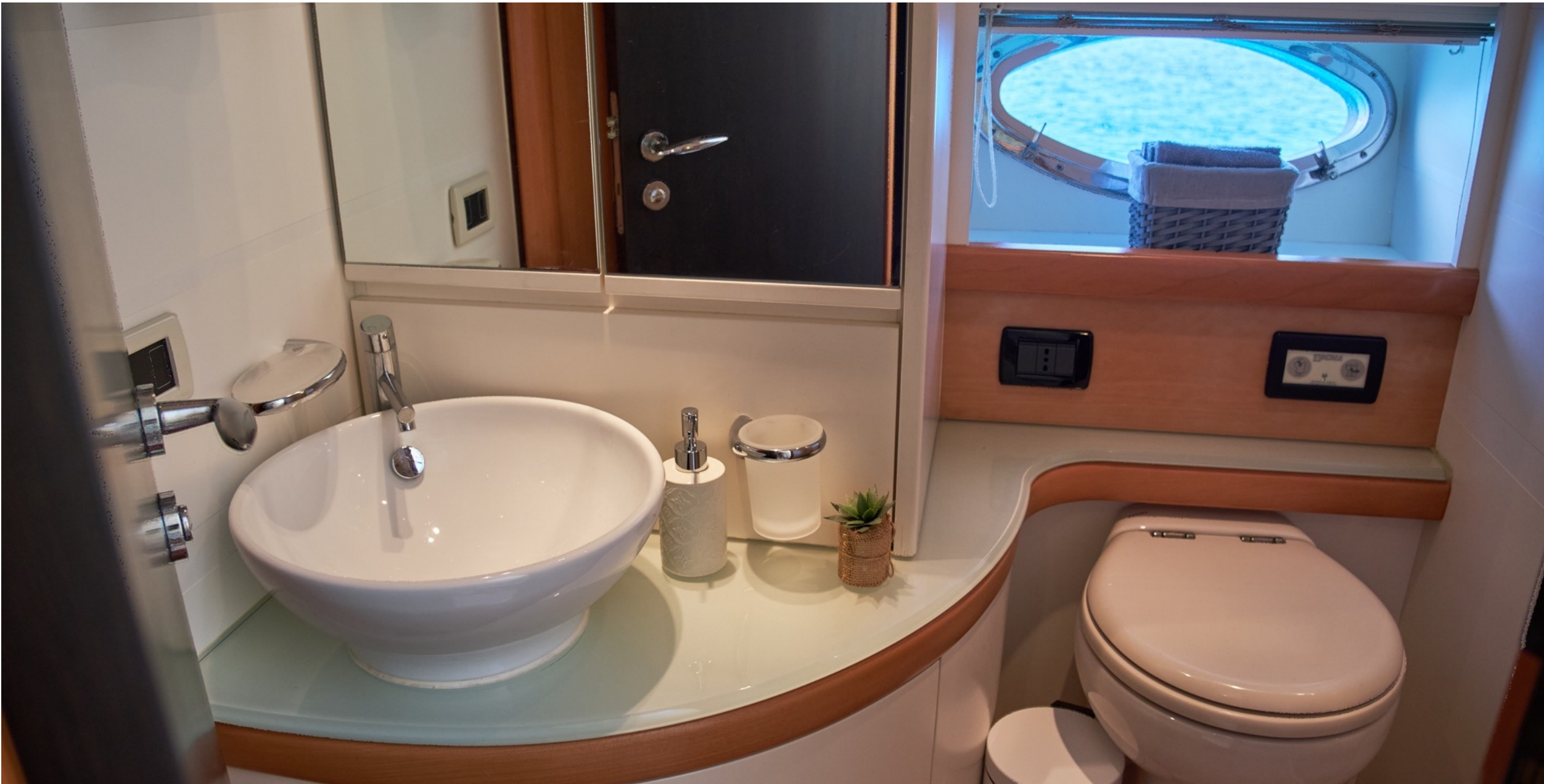
STINGER | PERSHING 76