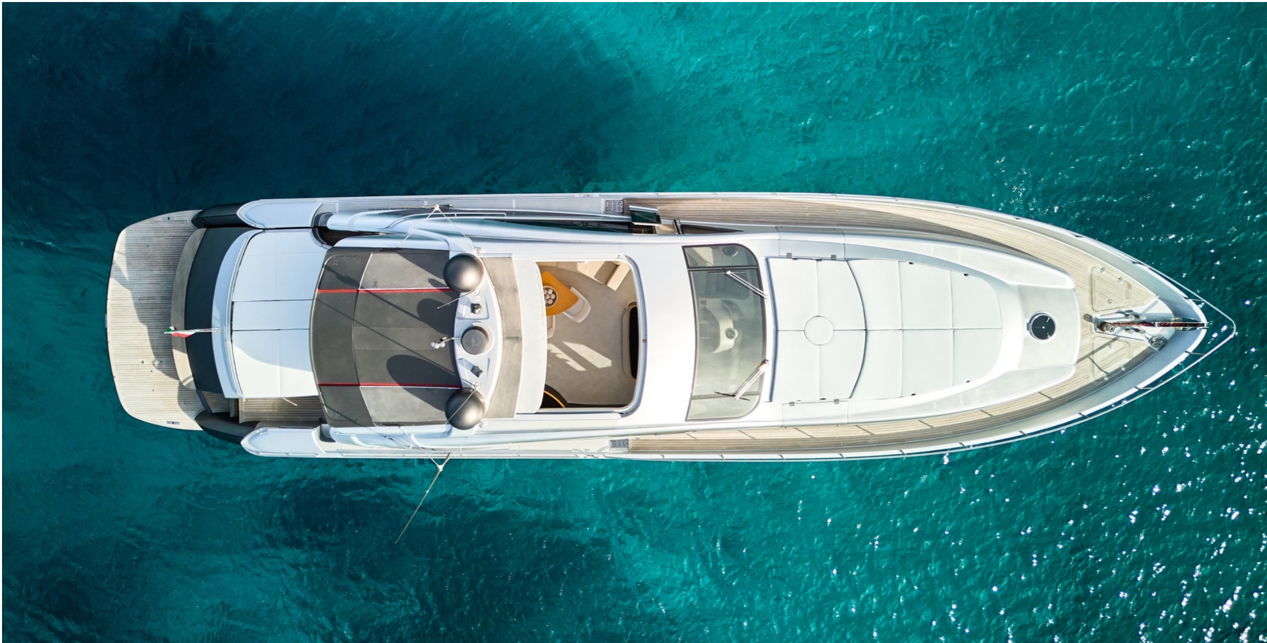
STINGER | PERSHING 76